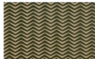
Zig Zag 030