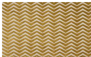
Zig Zag 020