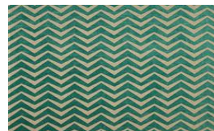
Zig Zag 080