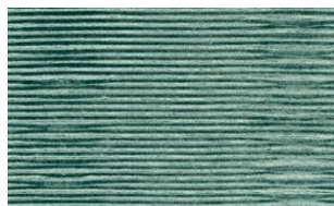
Vivendi o32 °