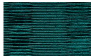
Vivendi o31 °