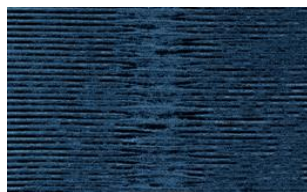
Vivendi o80 °