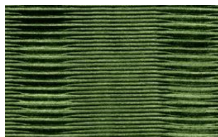
Vivendi o30 °