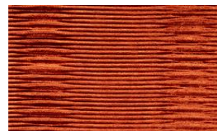
Vivendi 060 °