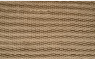
Tony Quilt 010