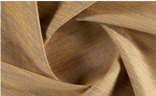
Softly Stripe 020