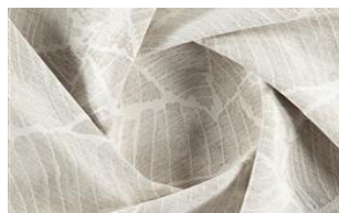
Softly Leaf 010