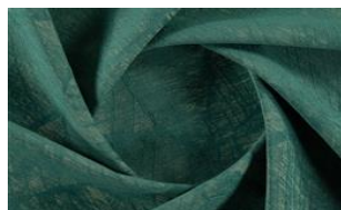
Softly Leaf 032