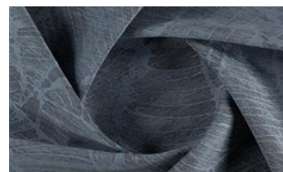
Softly Leaf 081