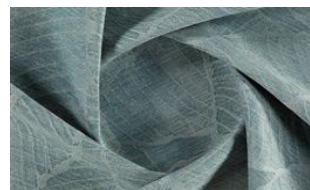
Softly Leaf 030