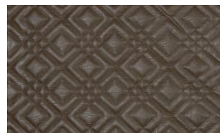
Ritzy Square 041