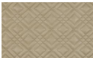
Ritzy Square 011