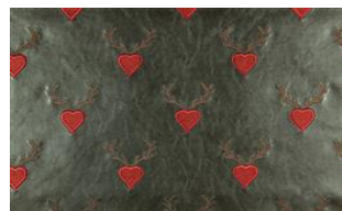
Prinz Lederherz1 048 *