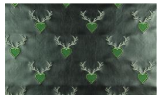
Prinz Lederherz 039 *