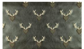
Prinz Lederherz1 049 *

* limited availability - please contact our sales team