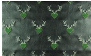
Prinz Lederherz 039 *