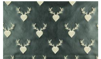
Prinz Lederherz 059 *