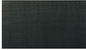
Mini Rhomb 070