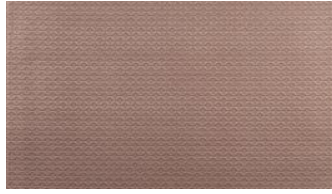
Mini Rhomb 051