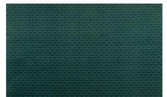
Mini Rhomb 032