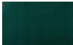
Mini Rhomb 031