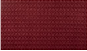
Mini Rhomb 050