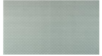
Mini Rhomb 080