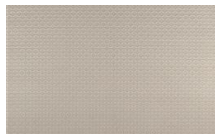
Mini Rhomb 010