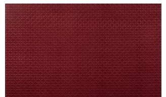
Mini Rhomb 050