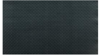
Mini Rhomb 081