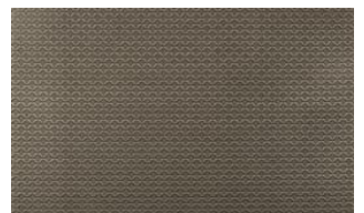
Mini Rhomb 040