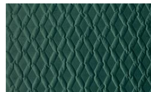
Luca Rhomb 032