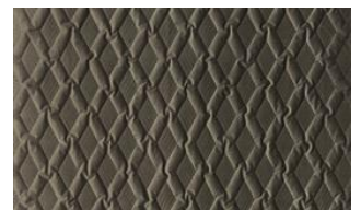
Luca Rhomb 040