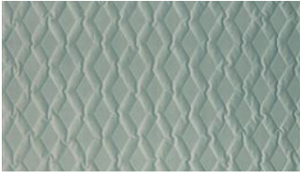
Luca Rhomb o80