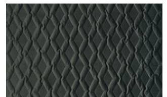
Luca Rhomb 070