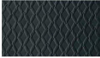
Luca Rhomb o81