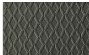
Luca Rhomb 041