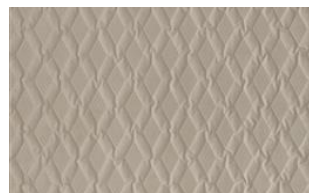
Luca Rhomb 010