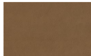
Little Joe 040