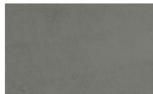
Little Joe 071