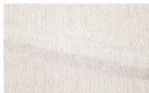
Be Fine 012