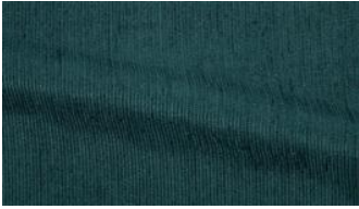
Be Fine 030