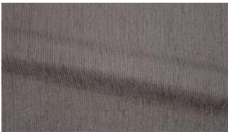
Be Fine 070