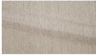
Be Fine 072