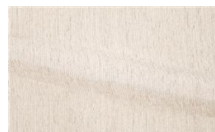
Be Fine 011