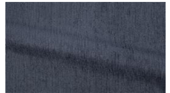
Be Fine 081