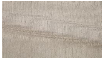
Be Fine 072