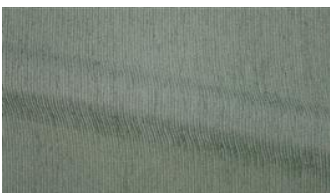
Be Fine 082