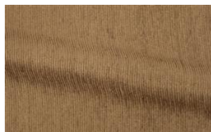
Be Fine 020