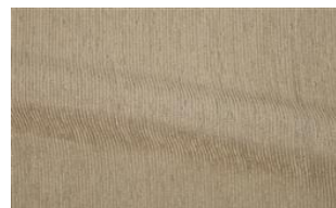
Be Fine 014