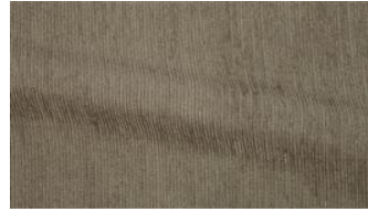
Be Fine 033