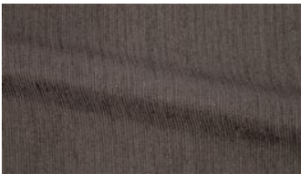
Be Fine 071