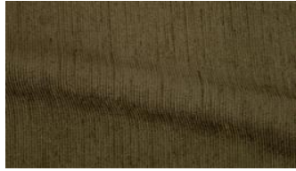
Be Fine 032