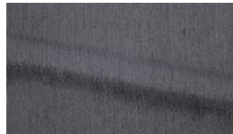
Be Fine 080