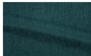
Be Fine 030