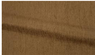
Be Fine 042