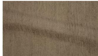
Be Fine 043