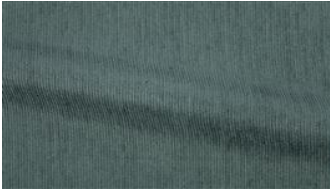
Be Fine 031