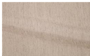
Be Fine 010