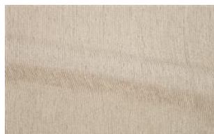
Be Fine 013