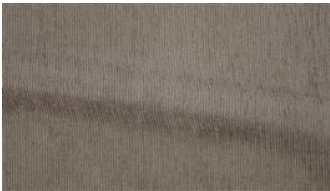
Be Fine 041